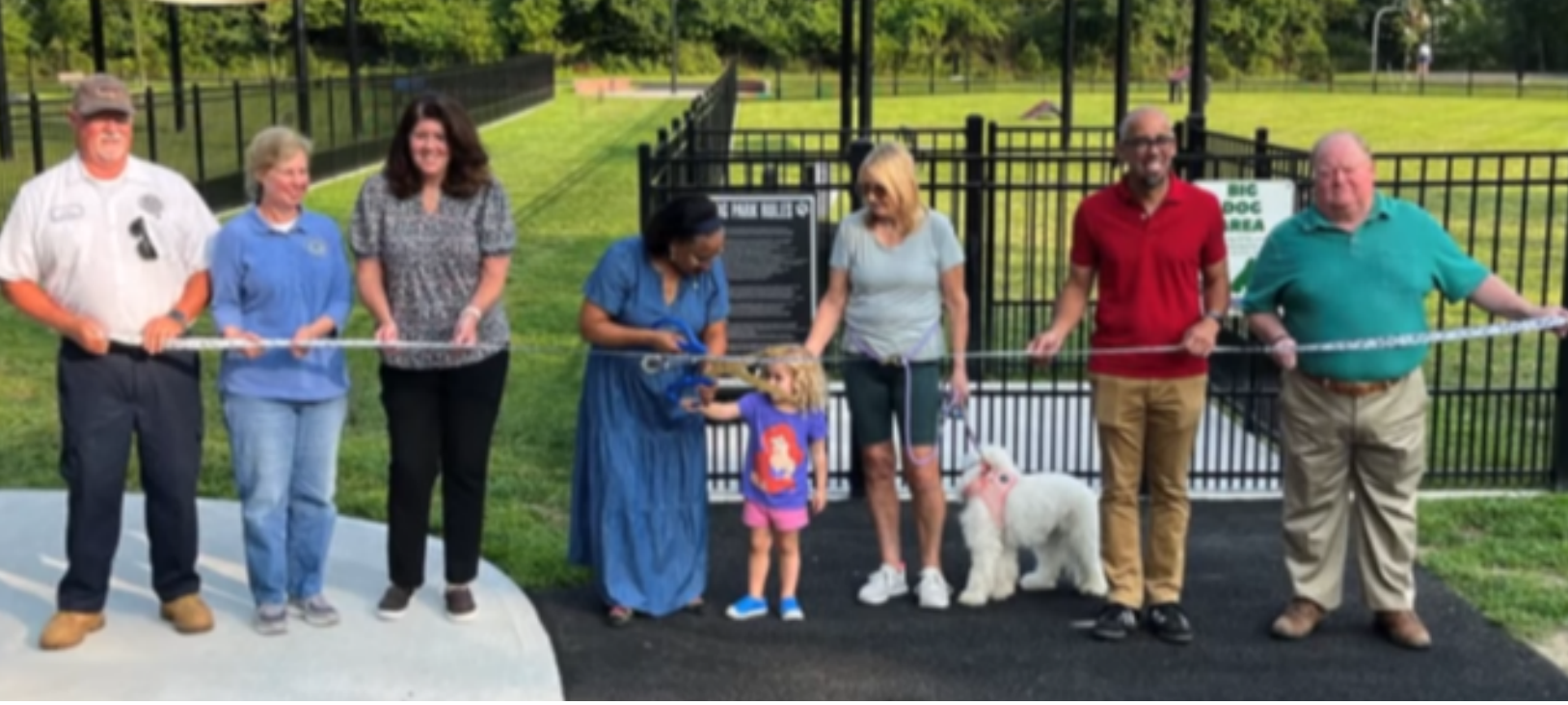
Lawrence Township Celebrates the Grand Opening of Hero Dog Park

Lawrence Township is thrilled to announce the grand opening of Hero Dog Park, a fantastic new space for our community and their furry friends. Located within Hamnett Park, this addition provides a safe and fun environment for dogs of all sizes, with separate areas for large and small dogs. The park's new amenities are the result of a significant $500,000 renovation project, with half of the budget—$250,000—dedicated to the dog park's construction.